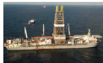
Drillship (Dynamically Positioned)