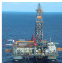
Column-Stabilized Unit (Dynamically Positioned)