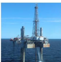
Self-Elevating Unit (Mat-Supported)