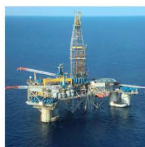
Column-Stabilized Unit (Moored)