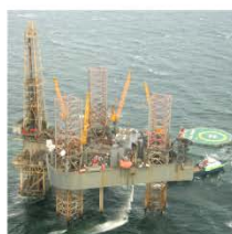
Self-Elevating Unit (Independent-Leg)