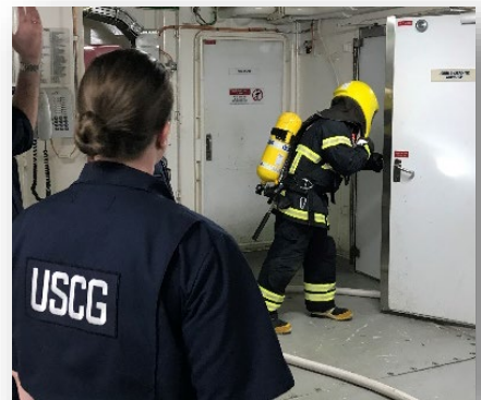
A Coast Guard inspector ensures the safe conduct of professional mariners during a safety exam.