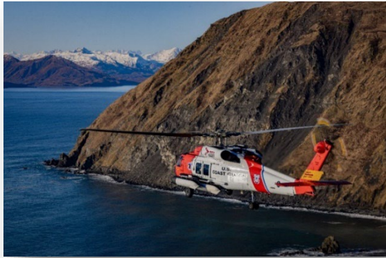
An MH-60T on a mission near Kodiak.