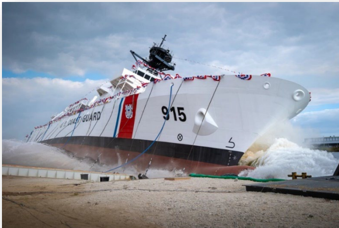
The first Offshore Patrol Cutter, CGC Argus, launched in 2023.