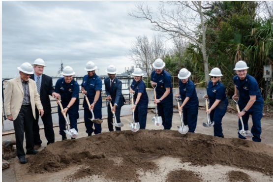
The Coast Guard breaks ground at Base Charleston, the Coast Guard's hub for Atlantic Area operations.