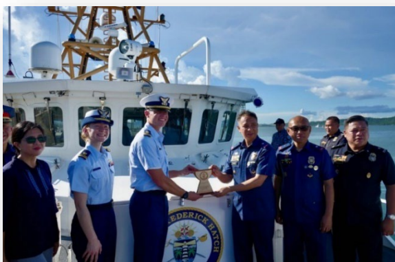
The crew of the CGC Frederick Hatch welcomes officials of the Philippines.