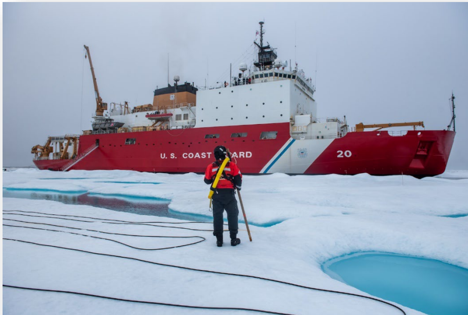
The crew of the CGC Healy, the Coast Guard's only icebreaker specifically designed for Arctic research, works with the Office of Naval Research to place scientific equipment in the Arctic Ocean Basin.

View the Coast Guard's 2025 Budget Overview and FY 2025 Congressional Justification document at: https://www.uscg.mil/budget/