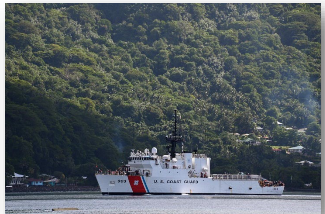
Indo-Pacific Support Cutter CGC Harriet Lane arrives in American Samoa.

The Service is steadfast in our commitment to ensure the Service has the capable, modern assets its workforce needs to meet the unprecedented growth in demand for Coast Guard services. The Service is making critical investments in the Offshore Patrol Cutter, Waterways Commerce Cutter (WCC), and the MH-60T fleet, and furthering C5ISR capability. Additionally, as the Service deploys larger and more capable assets, resilient recapitalization projects, such as piers and waterside support facilities, are vital to mission success.