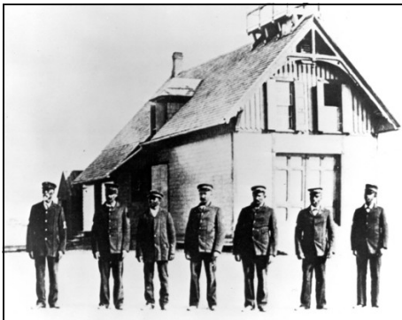
Pea Island Station Crew

War has served as a catalyst for change in the Coast Guard as it has for all the military services. During the Civil War, African Americans comprised five to ten percent of the crewmembers on board revenue cutters. Considering the small size of cutter crews, this proved to