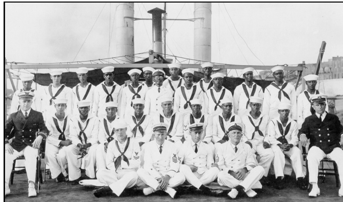
Crew of Cutter Yocona , 1925

be a de facto form of integration. During the war, the U.S. Lighthouse Service hired escaped slaves, or “contrabands,” to operate lights in Union-held territory. For example, Fishing Rip Lightship, off Port Royal, S.C., had a contraband crew during the war. It was the first federal vessel of any kind with an all African American crew.