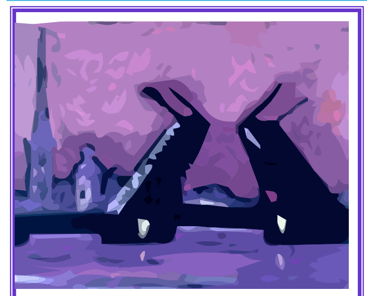
DRAWBRIDGE VIOLATIONS – UNREA-SONABLE DELAYS AND UNNECESSARY OPENINGS