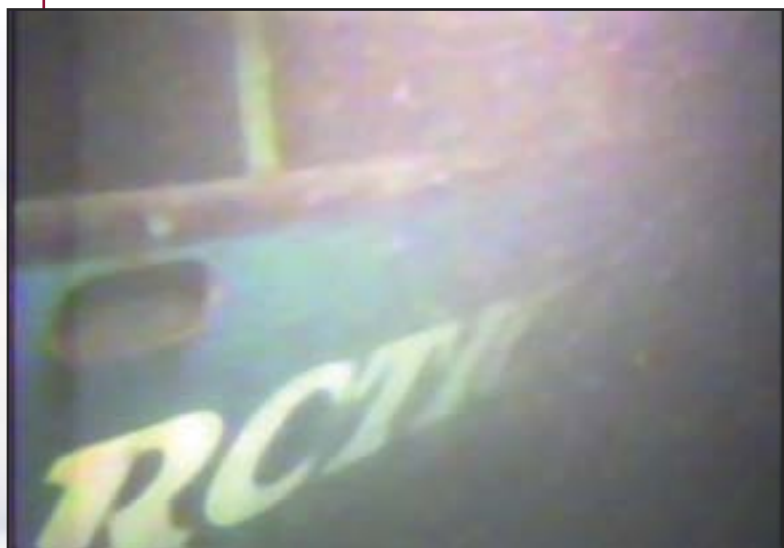
Photograph of the Arctic Rose taken during the remote operated vehicle expedition.

Approximately one hour after receiving the Coast Guard transmission, the Alaskan Rose entered a debris field and the crew spotted someone wearing an immersion suit in the water. They recognized him as the