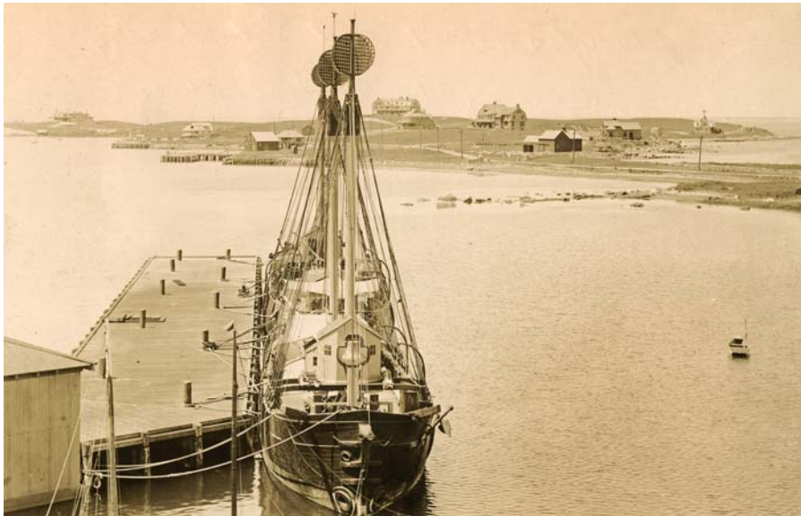
LV-9 & LV-39 at Woods Hole Depot

Office of the Lighthouse Board. List of Lights and Fog Signals on the Atlantic and Gulf Coasts of the United States. Corrected to June 30, 1901. Washington: Government Printing Office, 1901.