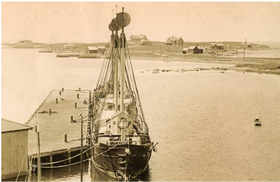
LV-9 & LV-39 at Woods Hole Depot